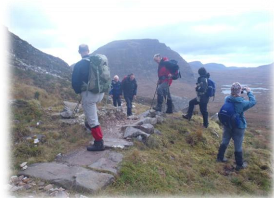
En route to Beinn Eighe; Picture Barbara Wyatt